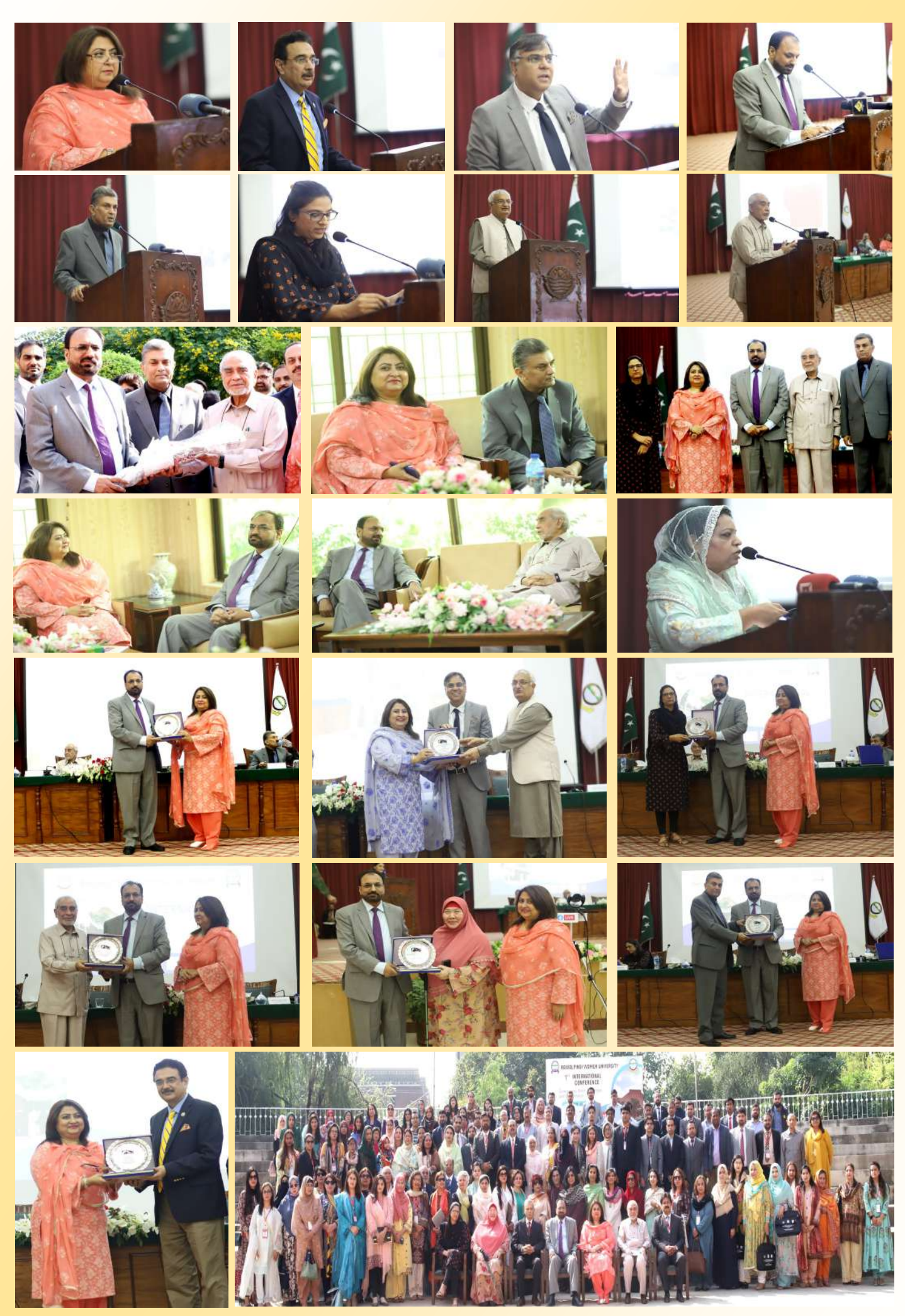
Rawalpindi Women University, NEWSLETTER, October - December, 2022 Website: http://www.rwu.edu.pk Facebook: @rawalpindiwomenuniversity